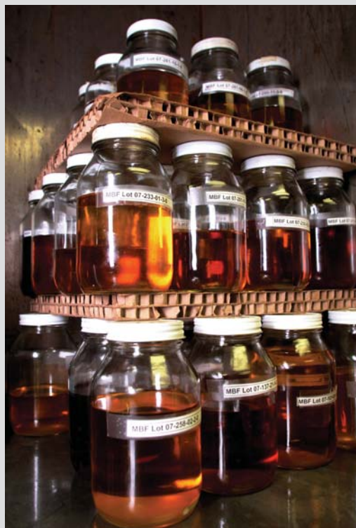
Biodiesel samples. In the future, Memphis Biofuels has set a goal to produce over 100-million-gallons of biodiesel annually.

Consistency and quality are essential in every drop of the commodity product. Every shipment of biodiesel produced at the plant is tested in the facility's lab. Each shipment must meet ASTM 6751 standard criteria for quality – including clarity, sulfur content, particulate matter, and methylester levels.