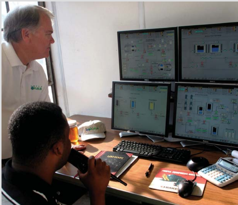
Faceplate and interlock screens help operators anticipate problems and keep the process moving.

"When we started the design and implementation of the control system, there was a set of diagrams that implied a certain operational framework," Arnold says. "Because the control system is extremely adaptable, we could add buttons, on the fly, to help the operators determine the flow, automatically fill the tanks, and switch the modes of the loops."